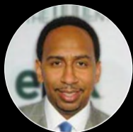
Stephen A. Smith